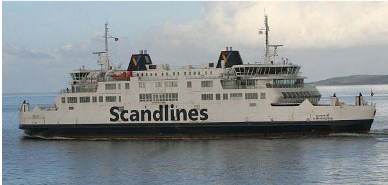
Aurora of Helsingborg

1992 – First marine SCR + OXI installation